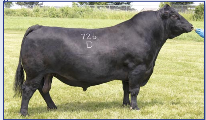
Sitz Stellar - Sire to Lots 38, 40, 42, 44-46 and 52

• Exceptional predigree, Stellar, 6EM3, Brilliance