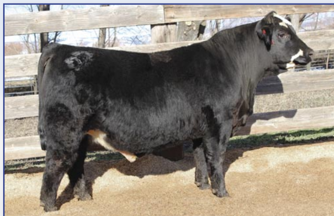
TFS Powder River - Maternal Grandson to Lot 113