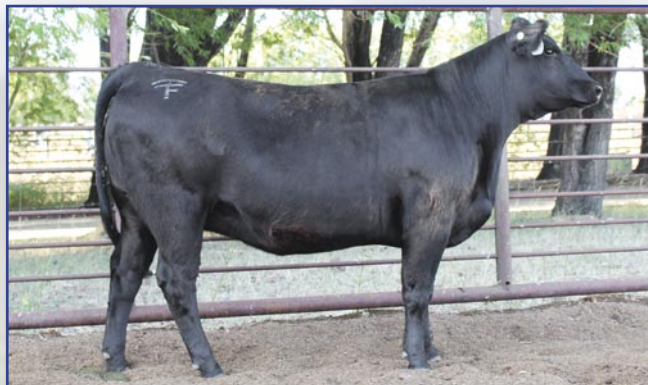
TFS DAWN 2680K – Lot 31

Due with a heifer calf on 2/19/24 AI sired by TFS Solution 8437F • Sired by TFS Raptor out of the best Lock N Load daughter at the ranch • Her dam records 3@103 for YW & 2@109 for REA