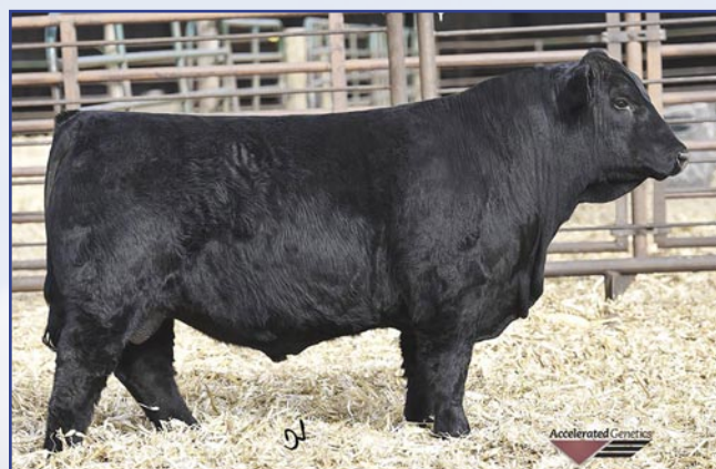
Hook's Bozeman - Sire to Lots 72 and 73