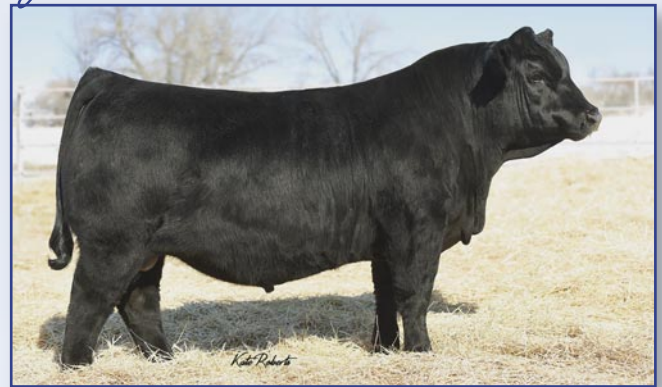
Hook's Eagle - Sire to Lots 25 and 34

• Her fantastic dam records 8@101 for WW, 5@104 for IMF, & 5@101 for REA