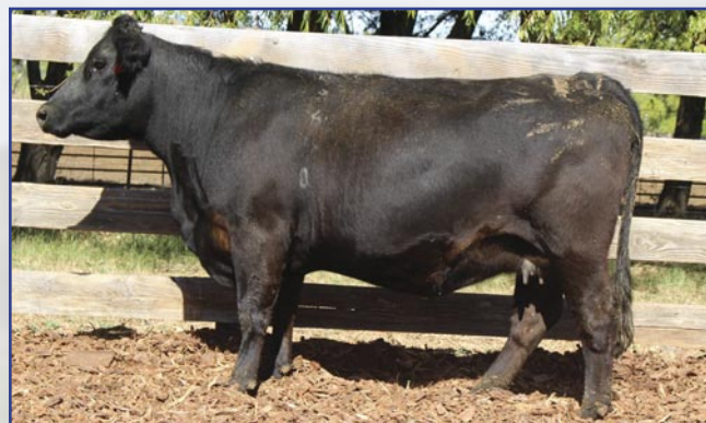
TFS Eclipse 8648F - Dam to Lot 56

• Put together a set of females with your desired predicted sex of calf