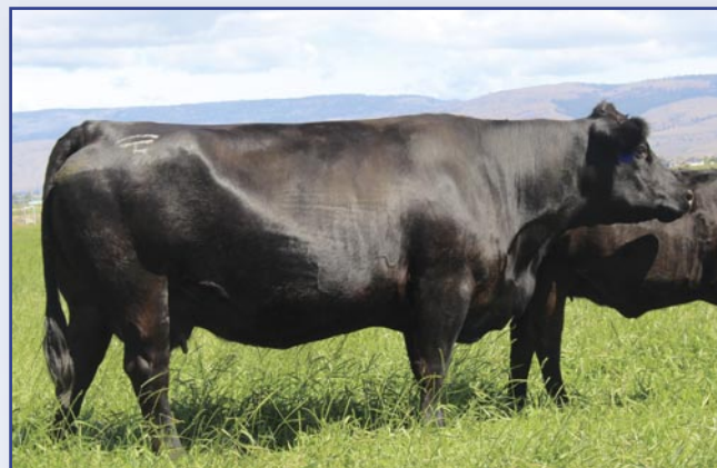
TFS Goldenglow 0011X - Dam to Lot 116

• From one of the most influential cow families at Trinity farms