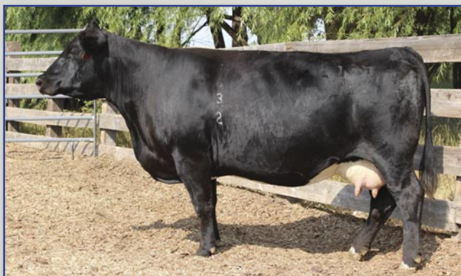
TFS Blkfleck B227 4632B Maternal granddam to Lot 18

Due with a heifer calf on 2/19/24 AI sired by TFS Solution 8437F • Double bred 0210 - the dam to TFS Black Powder • AI bred to the TFS Solution, one of our most successful Beef on Dairy Sires