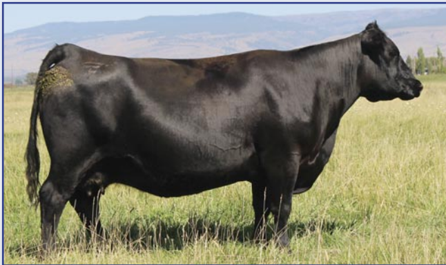
TFS COMMERCIAL 6268 Lot 84