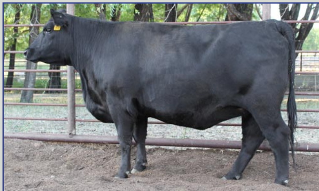
TFS ERICA 0381 1370J - Lot 41