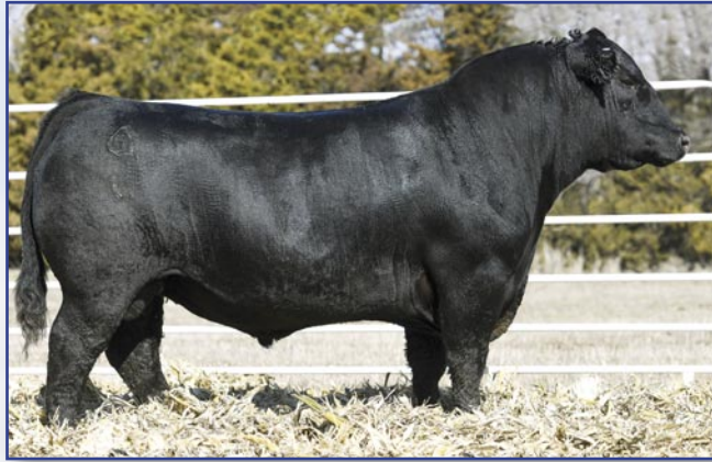
TJ Franchise - Sire to Lot 59