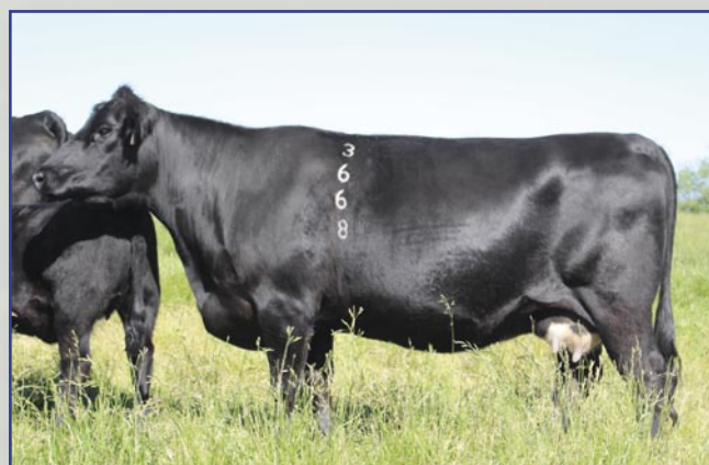
TFS Chalet 3668A - Dam to Lots 69 and 89