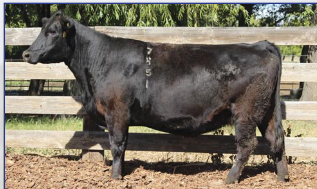
TFS Moon Shadow 7451E - Daughter of Lot 100

• She records 5@103 for WW & 4@107 for REA