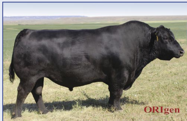
Rito 6EM3 - Sire to Lots 75 and 80

• With individual ratios of 111 for WW, & 106 for YW, she records 2 @ 103 for WW