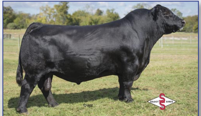
Connealy Capitalist - Sire to Lots 55, 57, 70 and 81