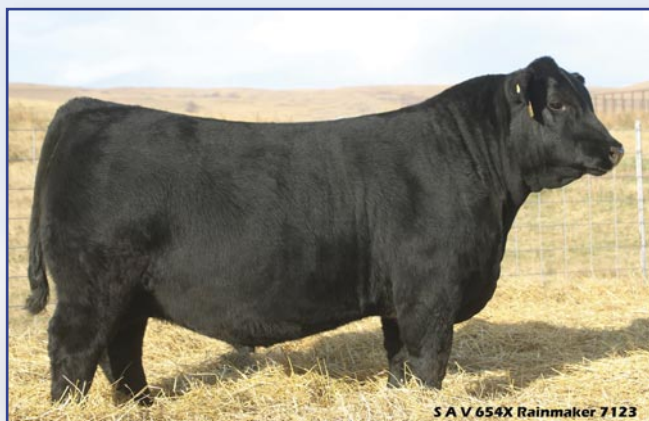
S A V 654X Rainmaker - Sire to Lot 61