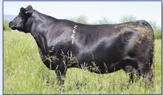
Lot 117 - TFS Racey Lady 2621Z Maternal granddam to Lot 15 and 44

Due with a bull calf on 2/19/24 AI sired by TFS Solution 8437F • She posts a top 15% Marb epd and her dam records 2@105 for IMF • AI bred to the TFS Solution, one of our most successful Beef on Dairy Sires