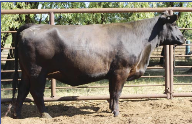
TFS ASHLEY 1663J – Lot 50