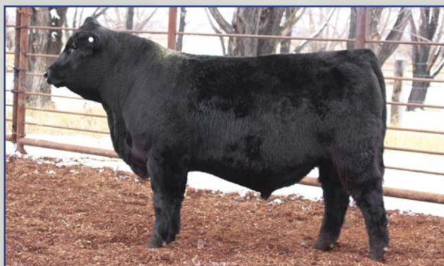
TFS Stellar 1394J - 2021 son of Lot 85, sold in 2022 for $6,500