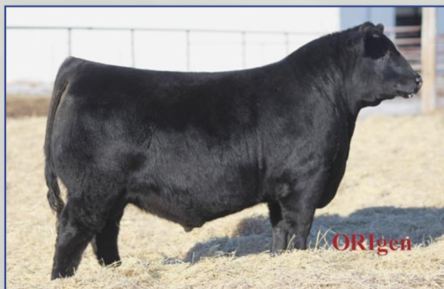
Brooking Bank Note - Sire to Lots 77 and 83