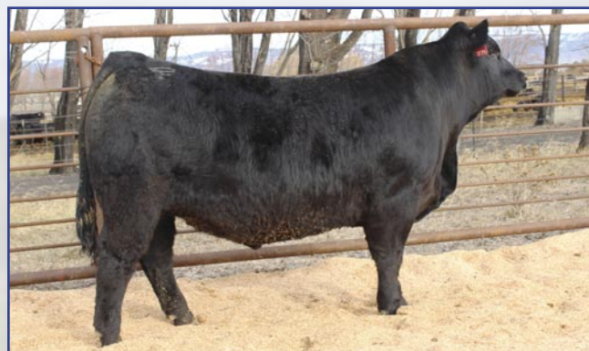
TFS Dozer - AI service sire to Lots 81 and 92

• A better fit for those who prefer April/May calving