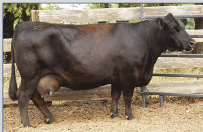
TFS Rosie 3747A - Maternal granddam to Lot 57