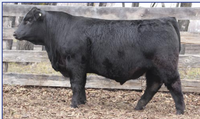
TFS Pay Dirt 0764H - 2020 son of Lot 99, sold in 2021 for $8,000