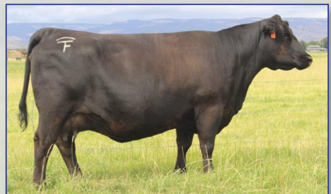
Trinity Erica 0381 1236 - Maternal great granddam to Lot 37 and Dam to 87