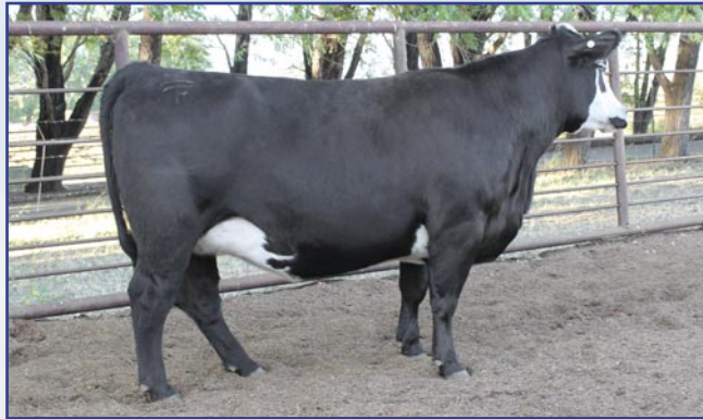
TFS SONATA 1332J - Lot 39