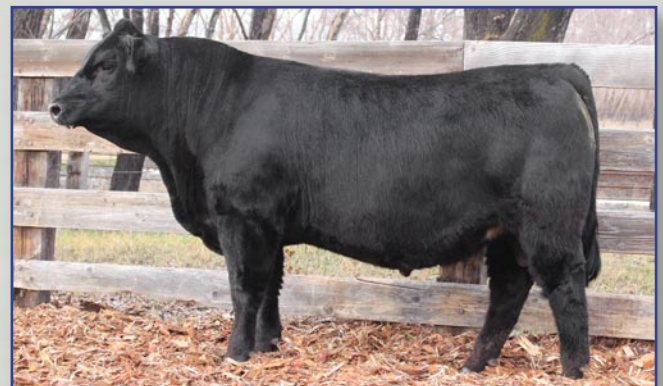
TFS Raptor - Maternal brother to Black Powder and sire to Lots 30 and 31

Due with a bull calf on 3/27/24 pasture sired by Group A • Her dam records 3@104 for WW & 2@123 for IMF • A better fit for those who prefer April/May calving