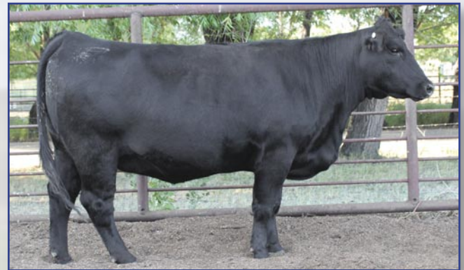
TFS ERICA 0381 1364J Lot 40

• Her dam records 6@107 for WW, 4@103 for YW, & 3@120 for REA