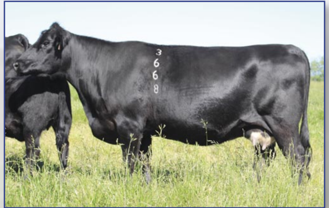
TFS Chalet 3668A - Dam to Lot 69 and 89