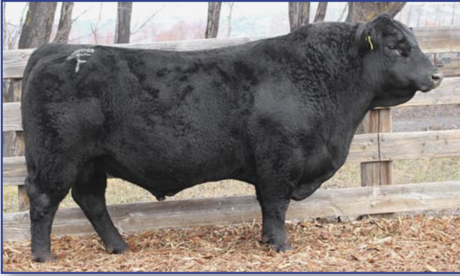
TFS Solution - AI service sire to bred heifer offering