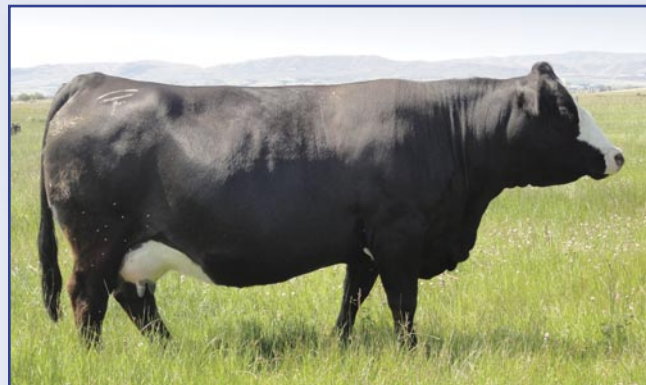
TFS Kylie 7587T - Dam to Lot 90

• Her dam was a popular cow with 30 ET calves along with her 7 natural calves