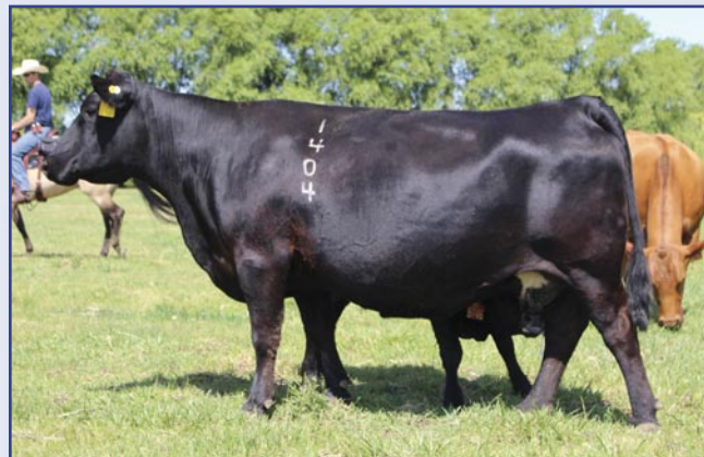
1/4 SM 3/4 AN 1404L - Maternal Granddam to Lot 112

• From 4513, one of the best female sires in the history of Trinity Farms