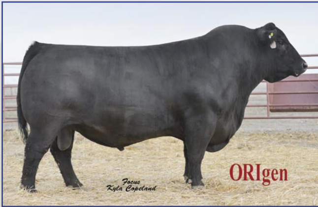
Musgrave Aviator - Sire to Lots 69 and 79