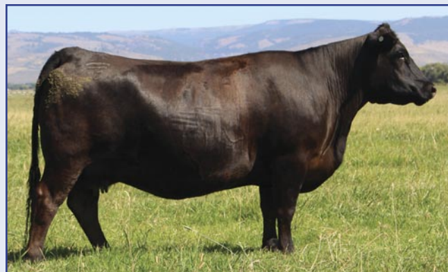
TFS FROLIC 0343H - Lot 55

• She posted an individual IMF ratio of 118