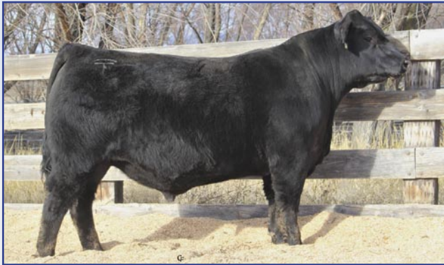
Trinity Mufasa - Sire to Lots 21 and 48 and maternal brother to Lot 22