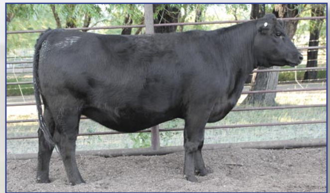
TFS LADY 1469J - Lot 44

Due with a bull calf on 3/3/24 pasture sired by Group A • Out of a dam that is a full sister to the dam of the high selling bull in this spring's bull sale • From the same family as TFS Samurai, TFS Due North and countless others