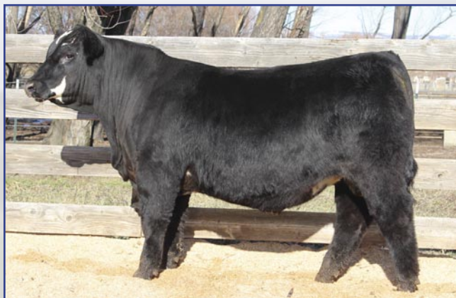
TFS Africa 9688G - 2019 son of Lot 107, sold in 2020 for $9,000

• Bred to the prover and popular TFS Black Powder