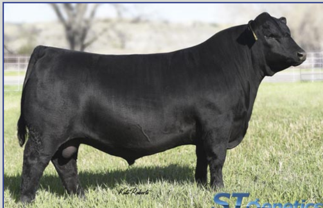
S A V Raindance - Sire to Lot 60 and 66