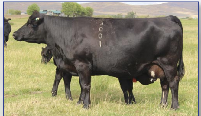
TFS Exotic 3001A - Dam to Lot 85 and TFS Monsoon