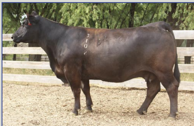
DD Top Grade 3102A - Dam to Lot 74