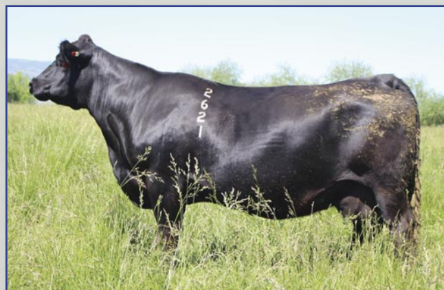
TFS Racey Lady 2621Z - Maternal granddam to Lot 15 and 44