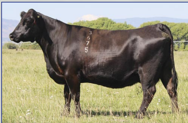
TFS ENCHANTMENT 3675A – Lot 111

• Bred to the prover and popular TFS Black Powder