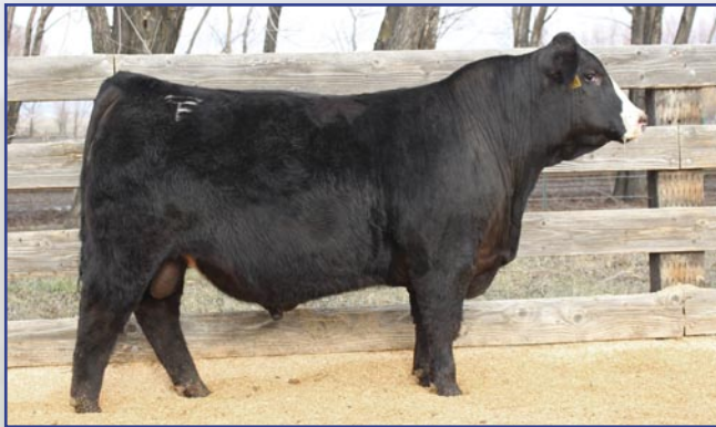
TFS Columbia - Sire to Lot 36