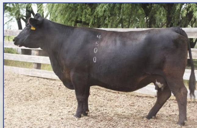
TFS Belize 4500B - Dam to Lot 66