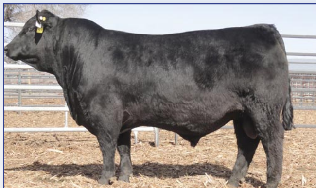
TFS Black Onyx - Maternal brother to Lot 91 and Sire to Lot 93