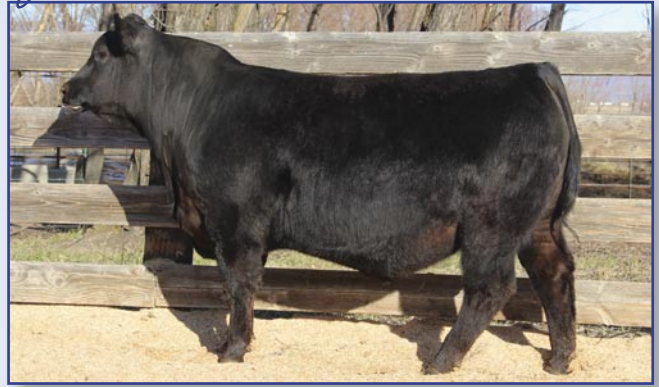
TFS Payweight 9318G - Sire to Lots 6 and 10