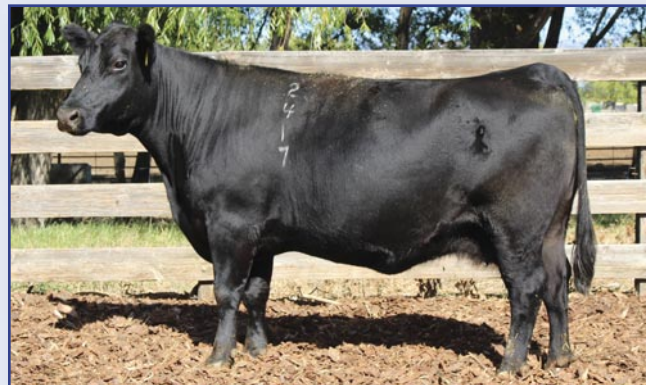
TFS Splash 2417Z - Dam to Lot 98

• A marbling improver, her sons ratio 120 for IMF!