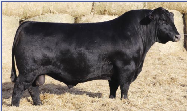
TFS Samurai - Sire to Lots 26, 27, 35, 53 and 64