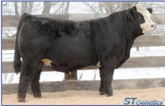
TFS Black Powder - Sire to Lots 28, 29, 54 and 63