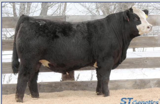
TFS Black Powder - Sire to Lots 28, 29, 54 and 63