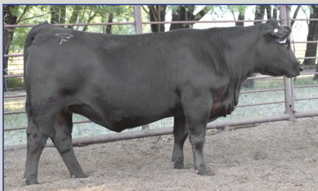
TFS COMMERCIAL 2638K - Lot 28

• Her dam records 4@103 for YW, 2@127 for IMF, & 2@104 for REA