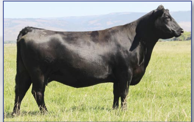
TFS ESPRESSO 9116G - Lot 60