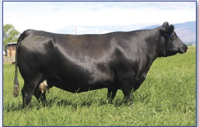
TFS Mesquite 0675X - Dam to Lot 68