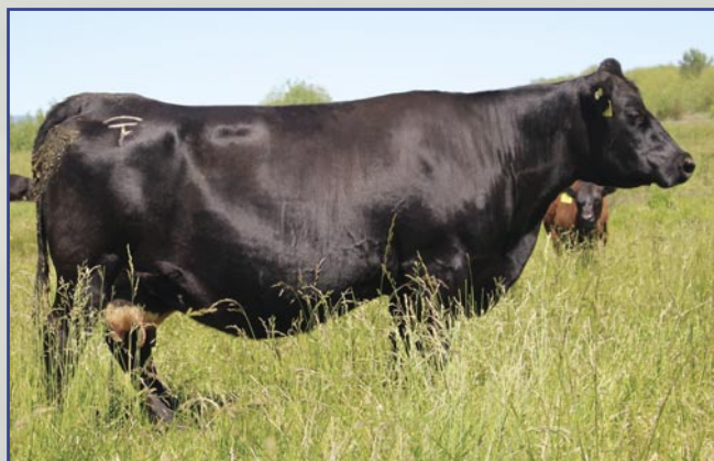
TFS BLK SATIN 2507Z - Lot 115

• A stout Net Worth daughter from a 4513 dam