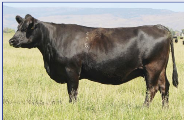
TFS ECLIPSE 9359G - Lot 61

• Bred to the exciting TFS Heritage, the #1 REA bull from this years spring bull sale