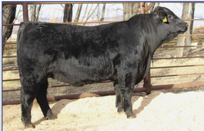
TFS Rainfall 2295K - 2022 son of Lot 73, sold in 2023 for $7,750