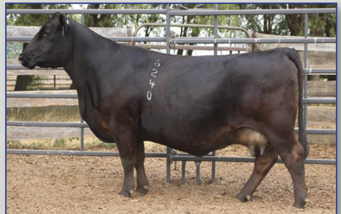
Trinity Espresso 6240 - Dam to Lot 60