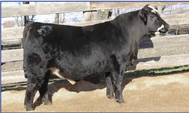
TFS Powder River - Maternal brother to Lot 3 and sire to Lots 41, 49, 50 and 51