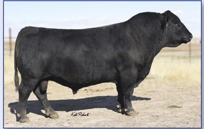
TFS Due North - Sire of Lot 58