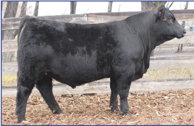
TFS Black Powder 0789H - 2020 son of Lot 108, sold in 2021 for $9,500

• Bred to the prover and popular TFS Black Powder