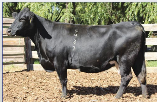
TFS Blk Satin 5437C - Daughter to Lot 115

• She records 7@103 for YW & 5@109 for REA