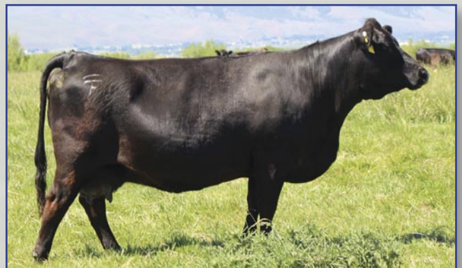
TFS Eclipse 2697Z - Dam to Lots 61 and 81