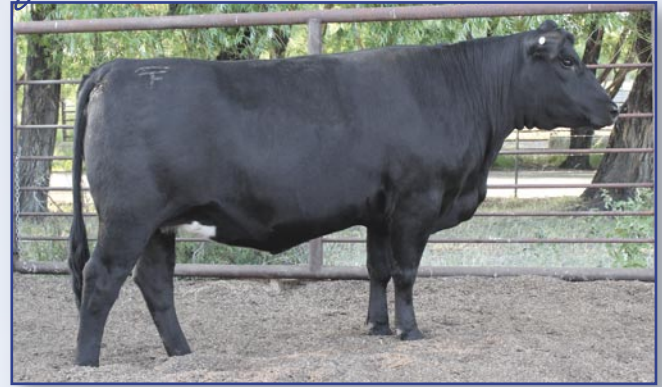
TFS MOON SHADOW 8615 1378J Lot 42

Due with a heifer calf on 3/7/24 pasture sired by Group A • An unprecedented opportunity to acquire a maternal sister to the dam of TFS Black Powder • Maternal Simgenetics at its best represented here