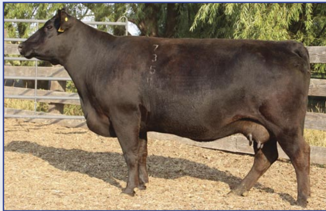
TFS Mandi 7354E - Dam to Lot 51