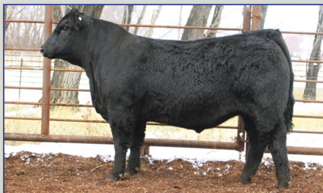
TFS Eagle 1648J - 2021 son of Lot 93, sold in 2022 for $6,500

• Bred to the promising performance sire TFS Dozer