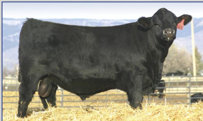
TFS Black Bear 3621A - Sire to Lot 97