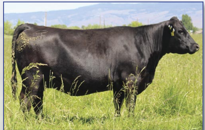
TFS 1/4 SM 3/4 AN 0414X- Maternal granddam to Lot 54 and 79