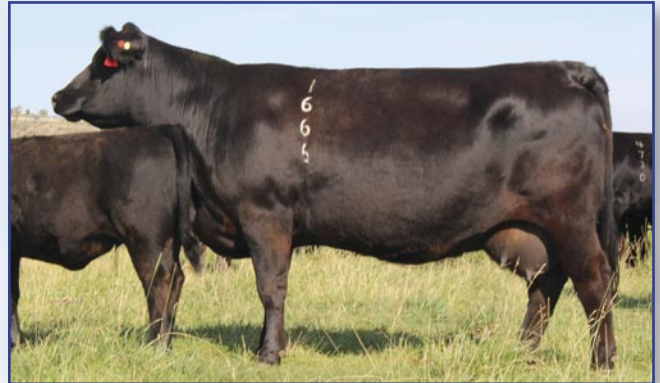
1666Y - Granddam to Lots 2 and 7