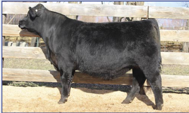
TFS Mufasa 9132G - 2019 son of Lot 102