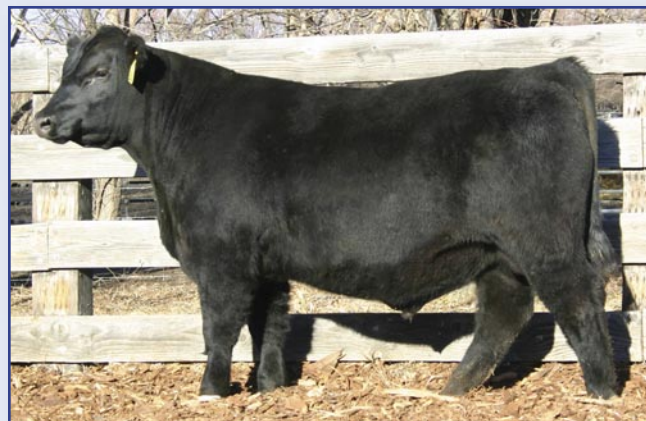
TFS Scorpion - Sire to Lots 86, 92, 94 and 95