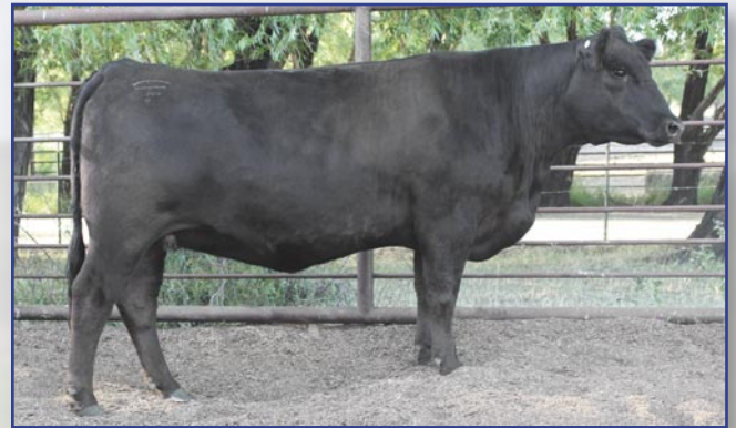
TFS Facet 1201 1302J - Maternal sister to Lot 22