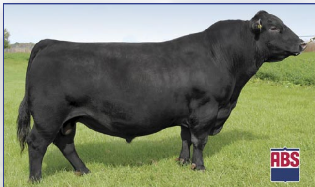
KM Broken Bow - Sire to Lot 56