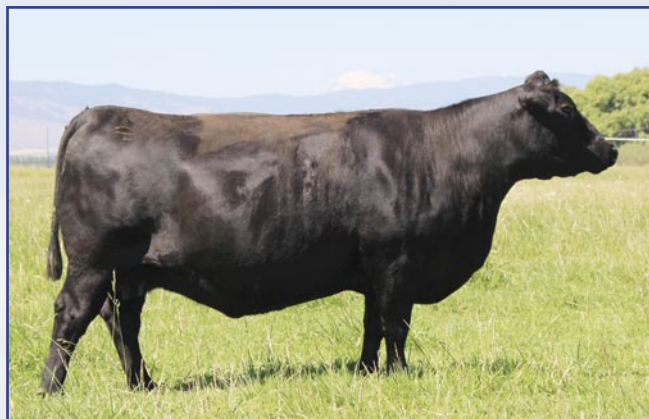
SACKMANN DIXIE ERICA 9501 – Lot 65