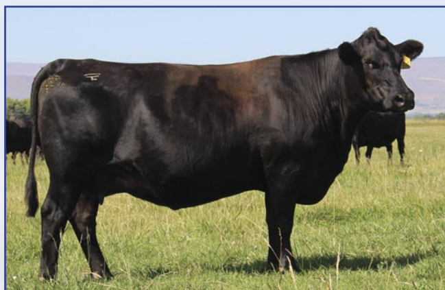
DD MAIN EVENT 714E – Lot 76