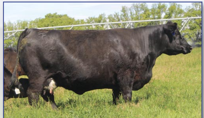
TFS Limelight 0650X - Maternal Granddam to Lot 27

• Her dam records an amazing 3@132 for IMF