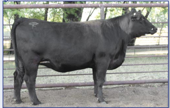
TFS MANDI 1688J – Lot 51