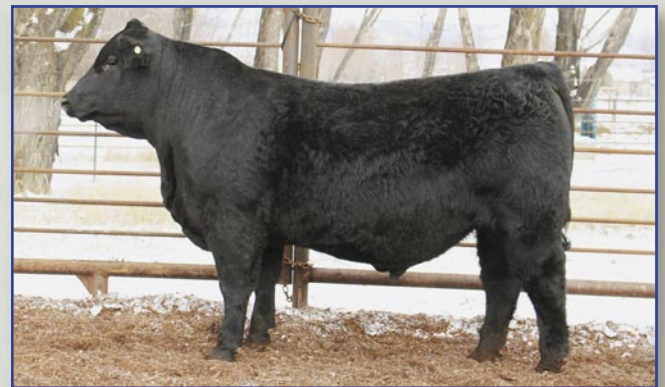
TFS Monsoon - Maternal brother to Lot 85