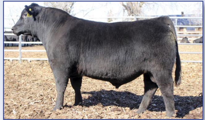
Trinity Stinger - 2016 son of Lot 102