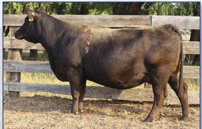
TFS Royal Flush 8345F - Daughter of Lot 110

• If you like them powerful, she is the kind