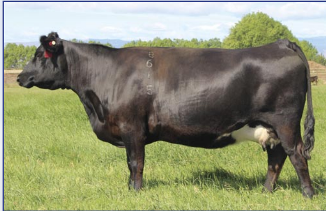
TFS Moonshadow 8615U - Dam to Lot 42 and maternal granddam to TFS Black Powder