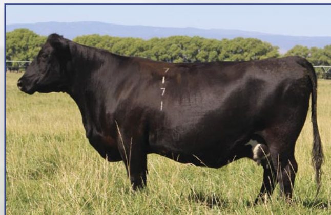
TRINITY ASHLEY 7171 – Lot 77

• A stout Bank Note daughter that posts individual ratios of 119 for WW, & 116 for YW