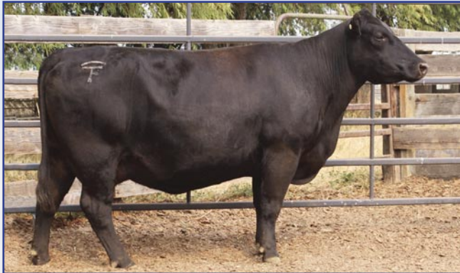
TFS Wildflower 5469C - Dam to Lot 80