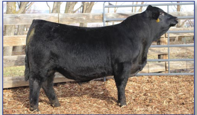
TFS Solution 0328H - 2020 son of Lot 95, sold in 2021 for $7,500