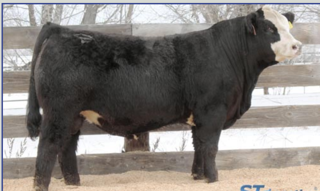
TFS Black Powder - AI service sire to Lots 101, 107, 108, 110

• She records 5@101 for YW & 2@103 for REA