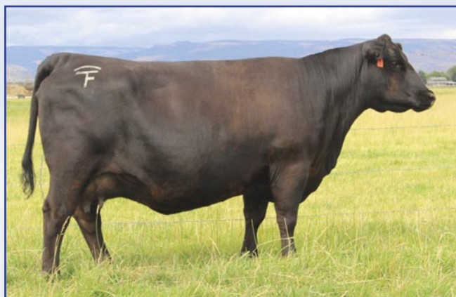
Trinity Erica 0381 1236 - Dam to Lot 87