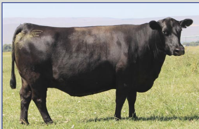
TFS FACET 8151 – Lot 67