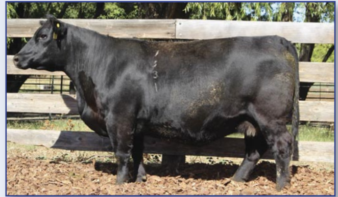
TFS Mesquite 7331E - Daughter of Lot 95