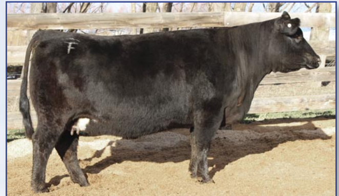
TFS Black Moon 0210 - Dam to TFS Black Powder, TFS Raptor and Granddam to Lots 15-18, 28-31, 35, 46, 54 and 63