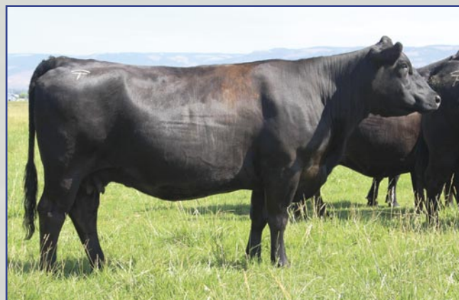
DD/TFS DREAMER 8715F - Lot 74