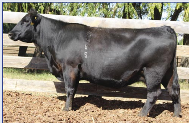
TFS Sonata B227 4485B - Dam to Lot 64