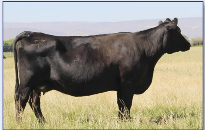
TFS FANCY FREE 3632A – Lot 108