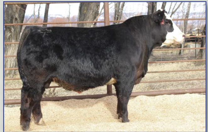
TFS Arnold 2734K - 2022 son of Lot 70, sold in 2023 for $10,000