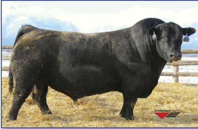
Coleman Charlo 0256 - Sire to Lots 67 and 68