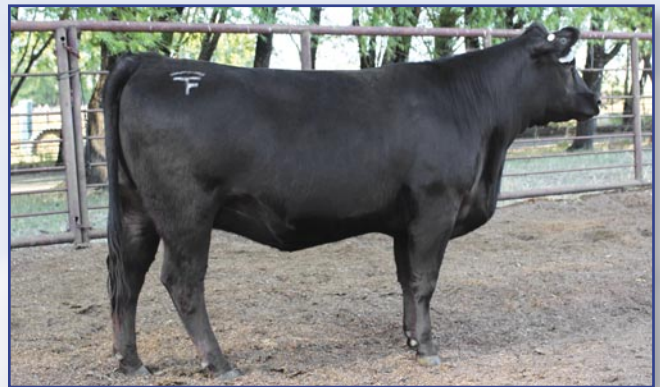
TFS DAWN 2679K – Lot 30

Due with a bull calf on 2/19/24 AI sired by TFS Solution 8437F • Sired by TFS Raptor, the maternal brother to TFS Black Powder • Top 2% CE, 2% BW, 4% MCE, 2% Stay, 15% API