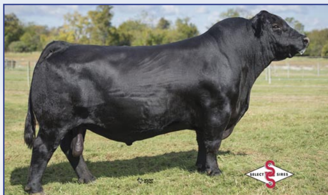
Connealy Capitalist - Sire to Lots 55, 57, 70 and 81